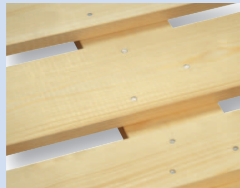
No waney edges and no significant mould growth