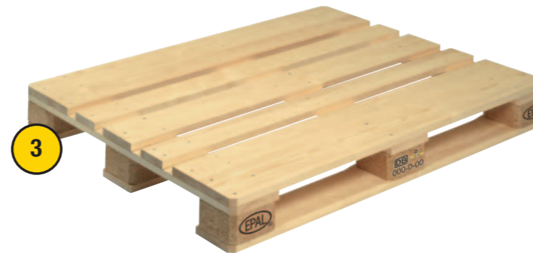
3. EUR 3-pallet - 1000 x 1200 mm