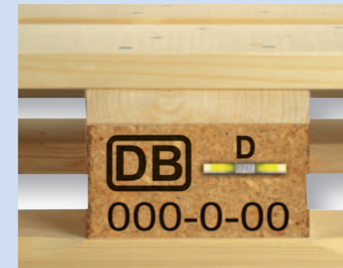
On the center block: the mark of the authorising railway company, e.g. DB; a mark denoting the country, e.g. D; the manufacturer's code