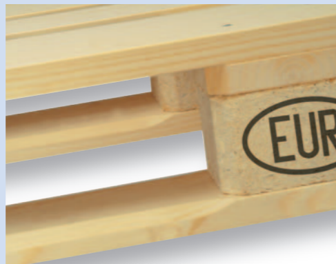
Chamfered bases: to make handling considerably easier