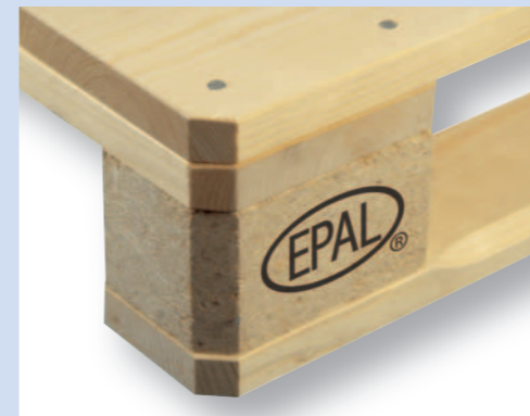
On the left block: the mark of the European Pallet Association, i.e. EPAL