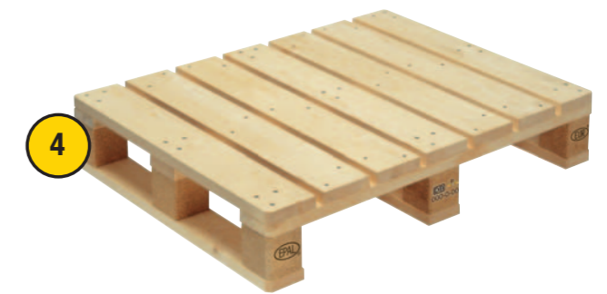
4. EUR 6-pallet - 800 x 600 mm

How can i identify an EPAL quality pallet: