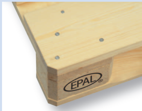
Standardized nailing: Only nails arranged in this way ensure the requisite stability

How can i identify an EPAL quality pallet: