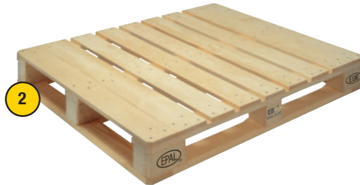
2. EUR 2-pallet - 1200 x 1000 mm