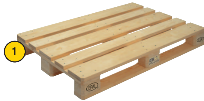
1. EUR-pallet - 800 x 1200 mm