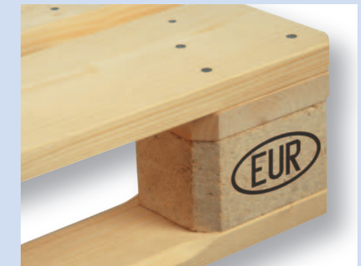
Right-hand marking: the mark of the European railway pallet pool, i.e. EUR