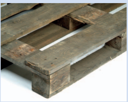
A board is missing.