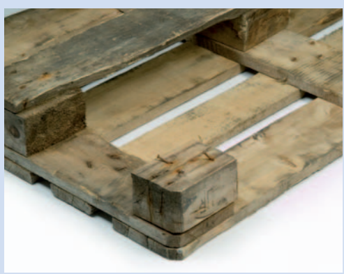
A single upper or lower leading board is damaged so that more than one nail or screw shank is revealed.