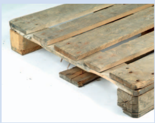
A block is missing or split to the point where more than one nail shank is visible.